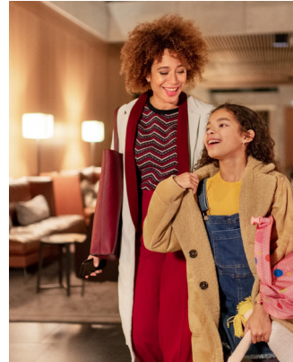
Energy and Building Technology