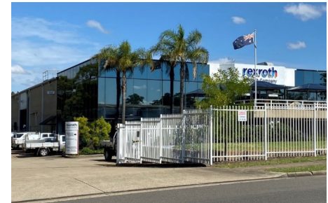
Australian Corporate Office 3 Valediction Rd Kings Park NSW 2148